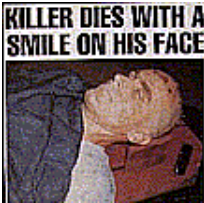
The wages of sin are death: Executed serial killer Ted Bundy. Note: Ted Bundy is not featured in this volume.